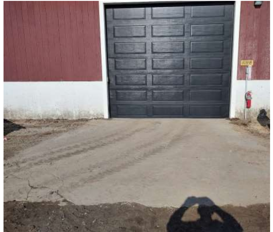
Exhibit E & 1-d. Concrete Pad to be removed and replaced with Asphalt