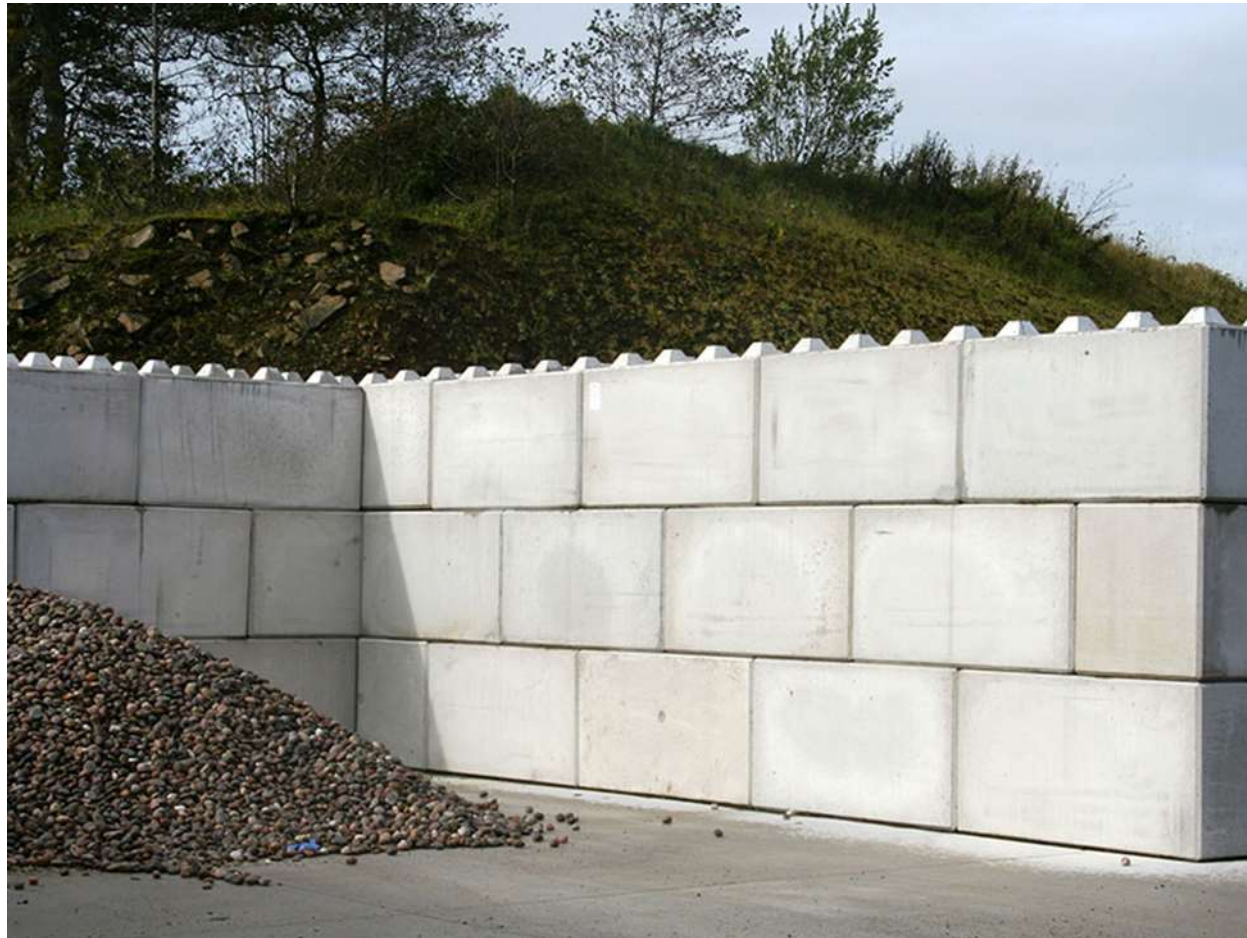
An example of Lego Style Concrete Block Retaining Wall W/O cap blocks