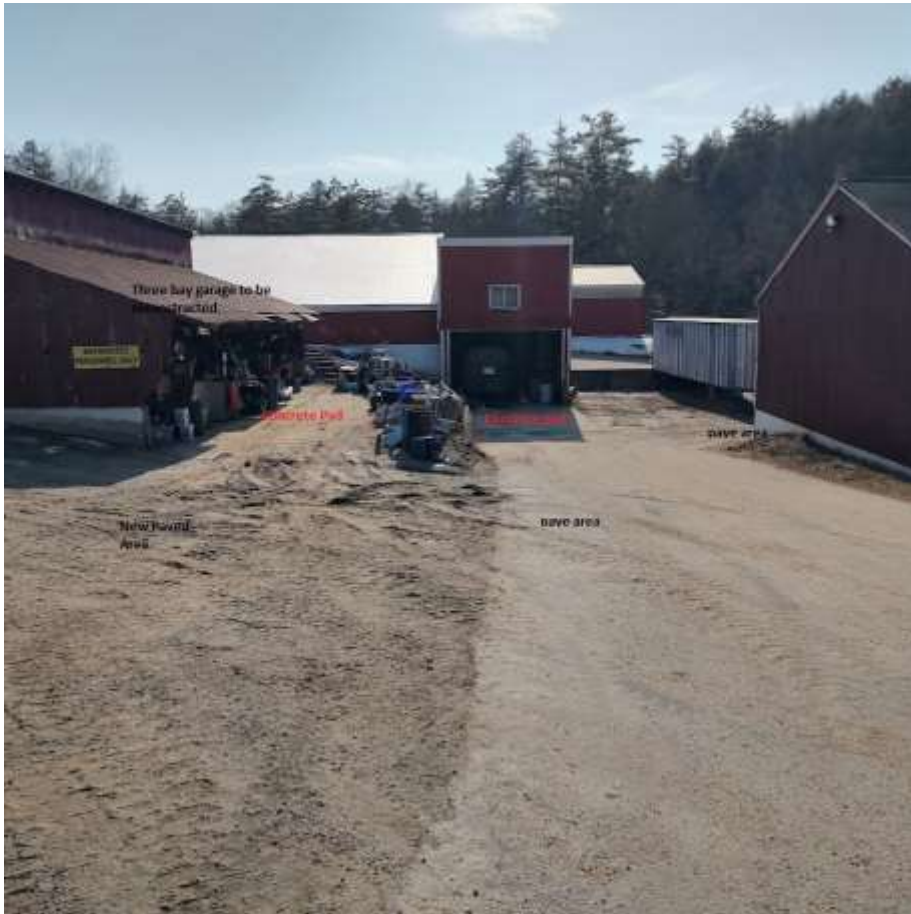
Exhibit 1-a. 106' x 17' asphalt driveway between Trash Compactor Concrete Pad and Residential Exit Road. To the left is Exhibit 1-b & 1-c