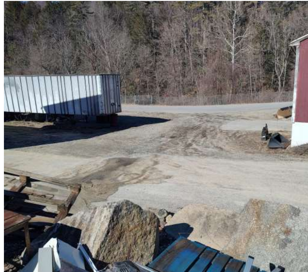
Exhibit 1-d New Asphalt connecting point 25' x 67' with turning flairs. This will include the 16' x 17' apron to building on right.

(view runoff water stain in direction of existing catch basin)