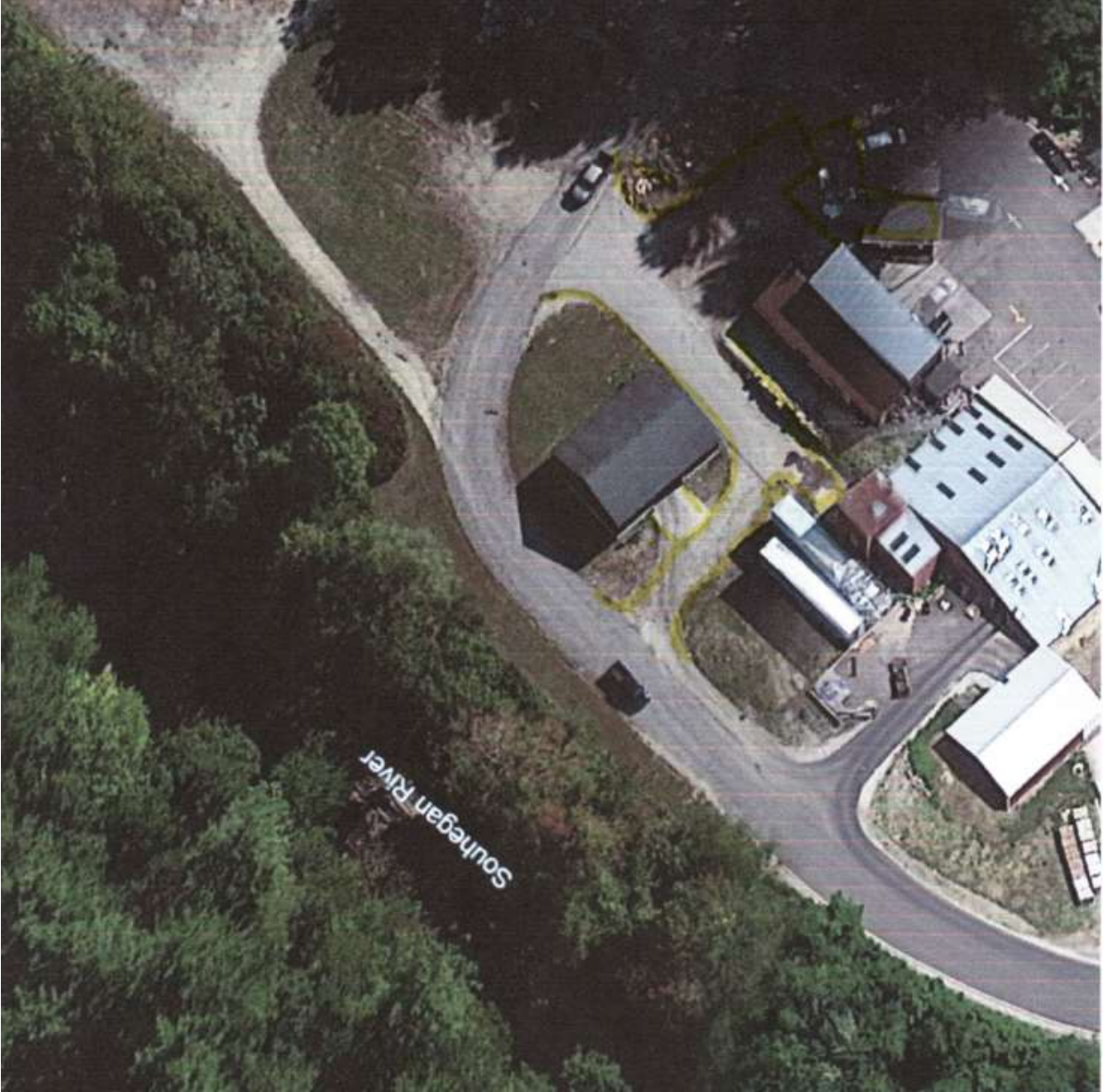
Aerial View of Wilton Recycling Center