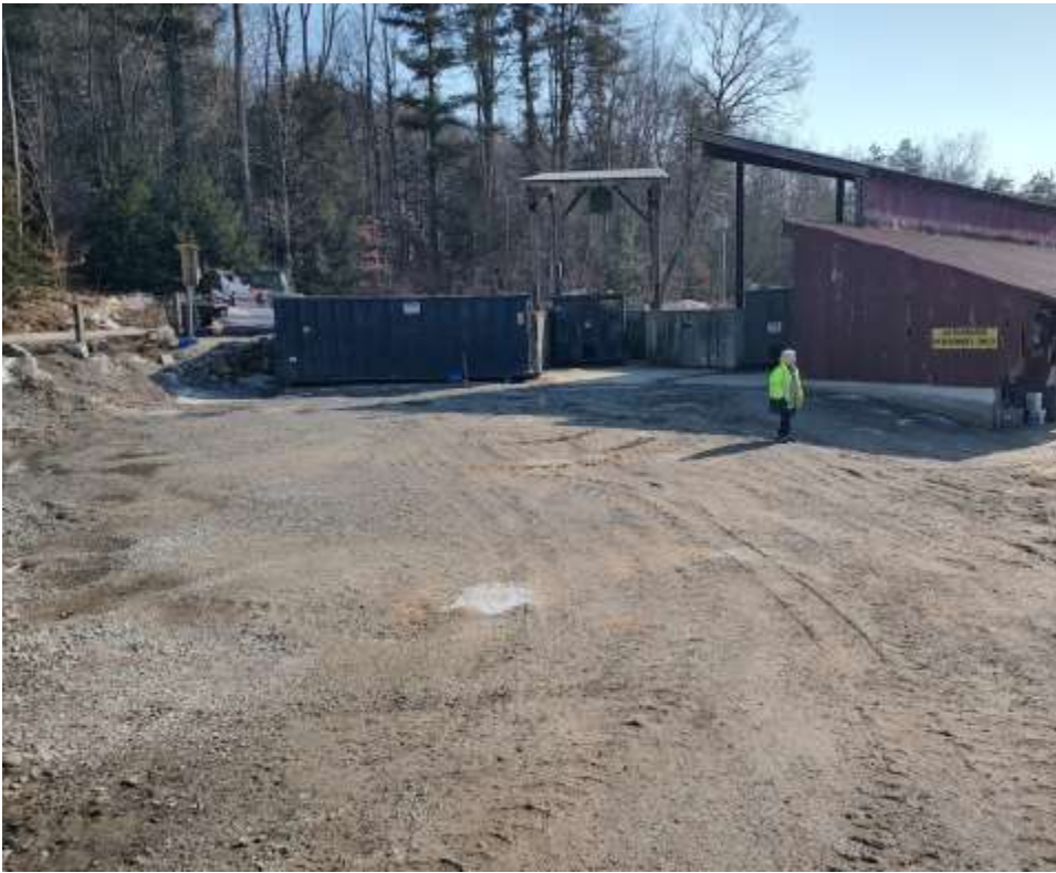
Exhibit D from afar and triangular Exhibit 1-c in forefront