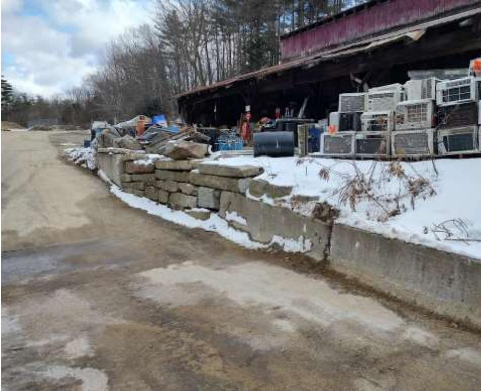
View of Exhibit A Existing Retaining Wall