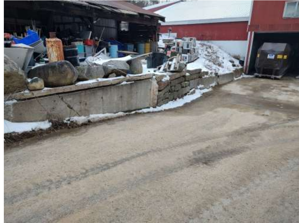
Exhibit A Opposing Viewpoint

Notice in both pics the runoff water stain across exhibit C